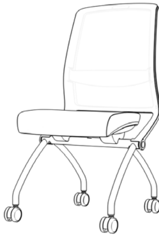
Mesh Back Armless