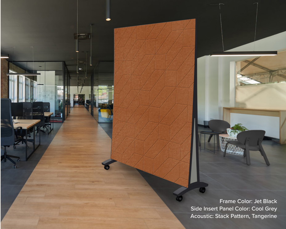
Frame Color: Jet Black Side Insert Panel Color: Cool Grey Acoustic: Stack Pattern, Tangerine

Acoustic panels reduce noise and add style wherever you put it.