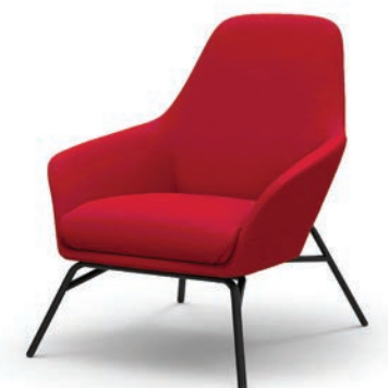
2501 Lounge Black Base 31.5" W x 30.75" D x 38" H