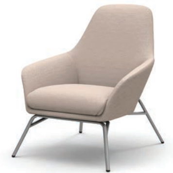
2501 Lounge Silver Base 31.5" W x 30.75" D x 38" H