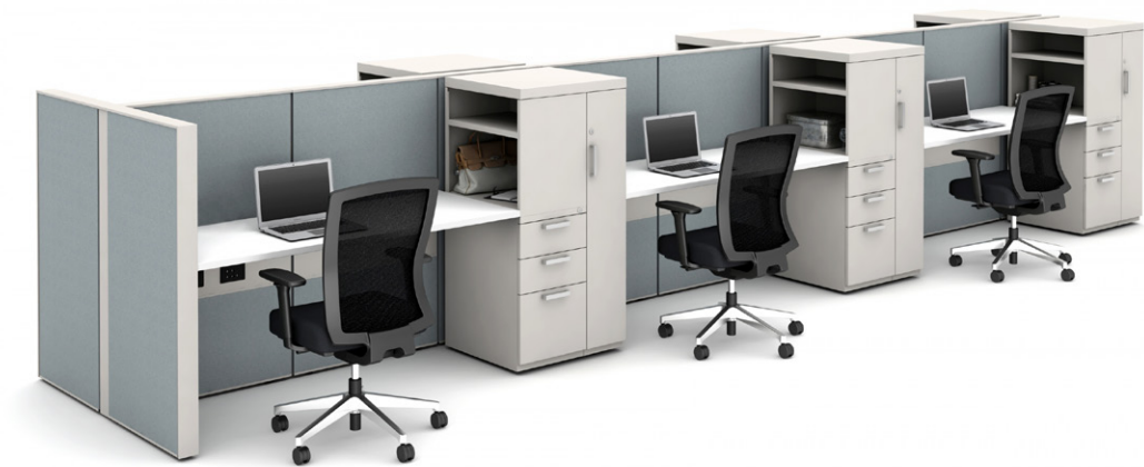
Storage towers easily divide space while ensuring users have personal filing and storage needs met.

Matrix serves a world of purposes, but don't take our word for it. Take a look at some of our favorite configurations. Then go dream up one of your own.