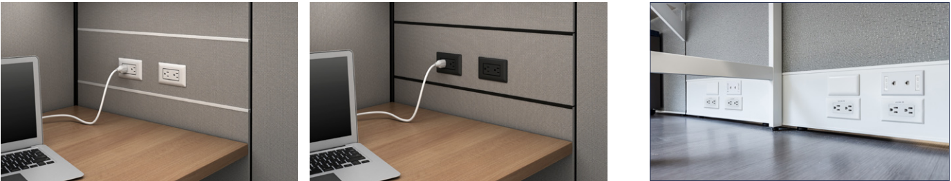
Matrix power above the worksurface can be specified in white or black finish.