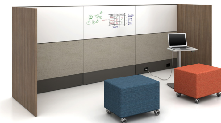
Matrix with Gallery Panels conveniently create collaborative spaces in the open plan.