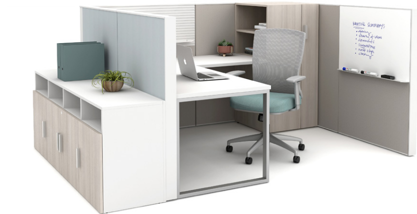
Calibrate storage can be specified to perfectly align with Matrix heights.