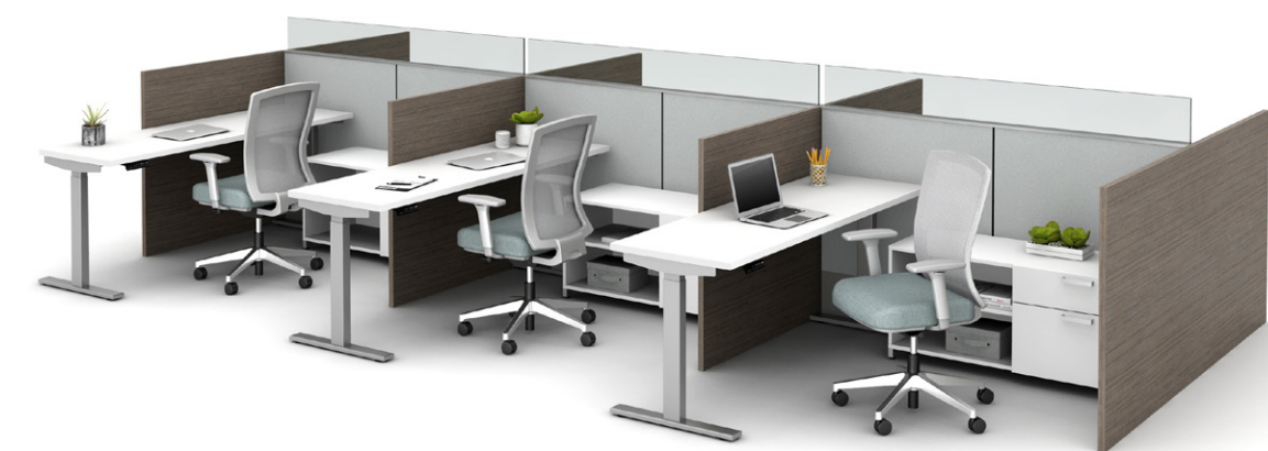
Laminate Gallery Panels bring levity to space and enhance design options.