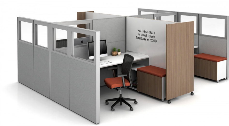
Design with glass tiles to support daylight and views for users.