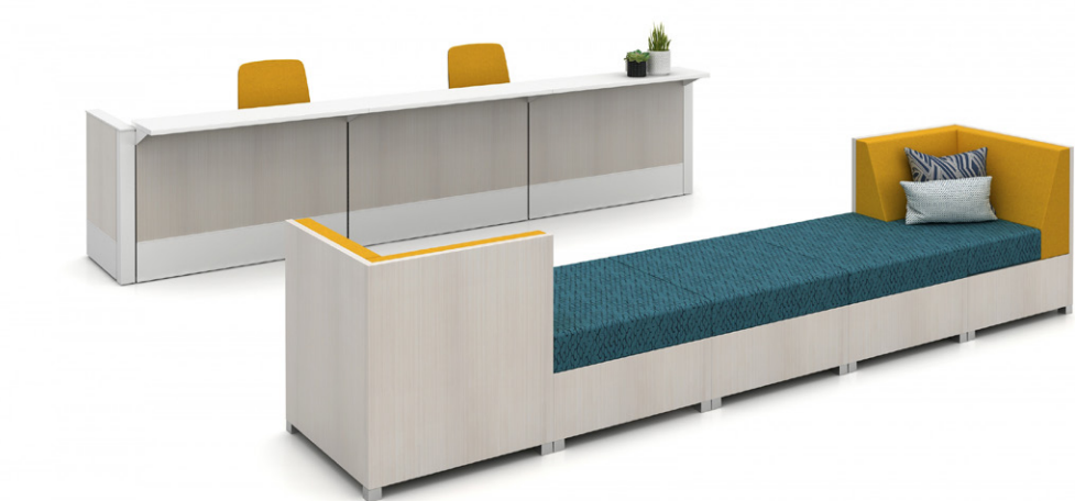
Design a reception station with Matrix, and coordinate materials across the company.