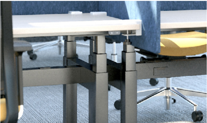
1-stage, 2-stage and 3-stage legs with anti-collision functionality