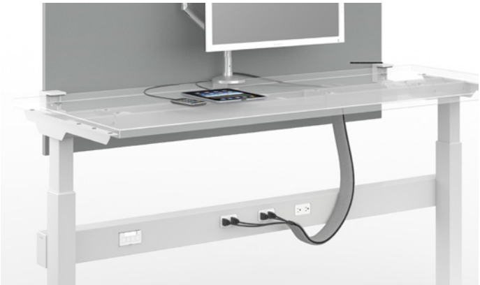
Soft cable management with 3 duplex option