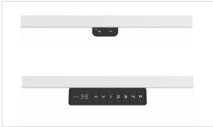
Standard up/down controls or upgrade option with 4 memory presets