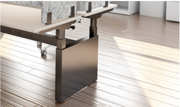
Privacy End Panels