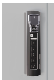
Nano E-Lock Mini Keypad (WE)