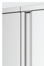
A - Full Pull

When specifying E-lock Mini or E-Lock RFID, Programming and Managers Keys are required to operate these locks. See page 57 of the pricebook online to order these key management accessories.