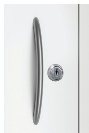
S - Satin Nickel Loop Pull Square Front