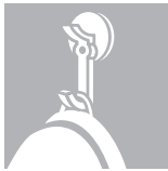
2-Prong Coat Hooks