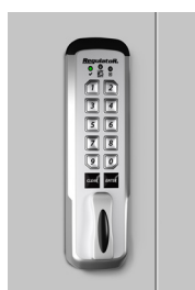
E-Lock Square Front or A-Full Pull